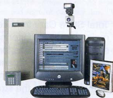
The Tyco C-CURE Access Control and Security Management System and American Dynamics Intellex system secured Jordan's Furniture stores.

The SURV solution has been installed at six of Jordan's facilities – retail stores, DCs, and its corporate office. Not only is it easier to investigate losses now, the perimeter of all buildings is monitored to reduce and/or eliminate vandalism and break-ins. All recorded data is saved at least 30 days in digitized form. If security events are investigated beyond 30 days, the recorded events are burned to CD.